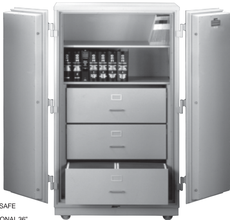
SCHWAB RECORD SAFE MODEL 3660CN SHOWN WITH OPTIONAL 36" LATERAL DRAWERS AND ADJUSTABLE SHELVES.

Our after-the-fire free replacement guarantee lets you know that once you have made the investment in a Schwab safe, we will be there if disaster strikes. We stand behind it, and have for over a century.