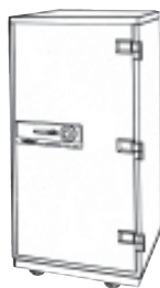
Model 2557 CN