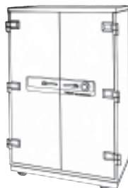
Model 3660 CN