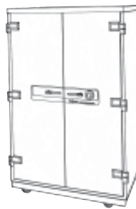
Model 4068 CN

SCHWAB CORP. Fire protection for vital records.™