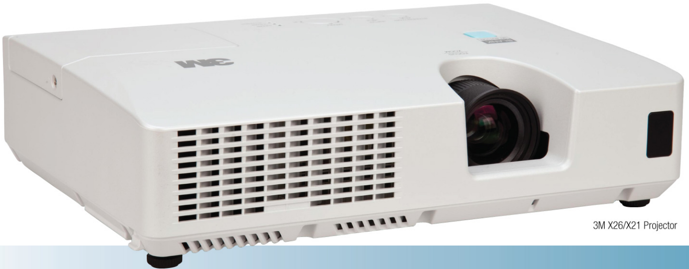
3M X26/X21 Projector

In the classroom the X26/X21 model offers White, Green and Blackboard modes. With built-in image templates the user can also project useful guides onto the screen for assisting annotation. Other cost-saving features that make the X26/X21 not only the ideal education projector but also a highly efficient business tool include Hybrid filters for 5,000 hour maintenance intervals; less than 1 watt stand-by power consumption; and 'Auto-eco' Mode for cost efficiency management.