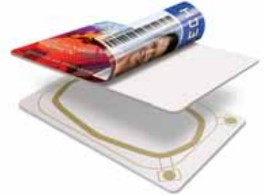
High Definition cards deliver the highest image quality — layered on the highest functionality. HDP Film fuses to the surface of proximity and smart cards, conforming to ridges and indentations formed by embedded electronics.

Fargo introduced High Definition Printing in 1999, and we've been advancing the technology ever since.