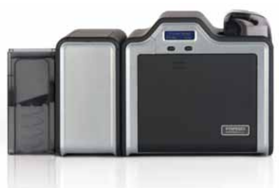
Learn more about the HDP5000 High Definition Card Printer/Encoder by contacting an authorized Fargo integrator. To find a Fargo integrator near you, visit www.fargo.com

Only one card printer offers ultimate image quality and printer reliability, affordably. For every need — from great-looking photo ID cards to multifunctional, high-security applications — the HDP5000 does the job beautifully.