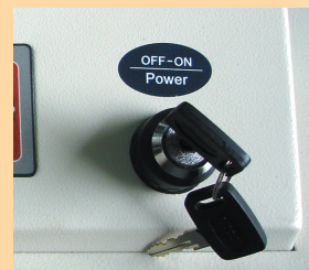
Keyed "On/Off" switch