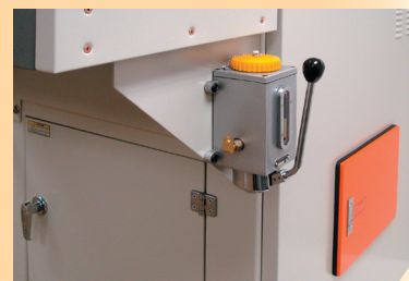
Optional EvenFlow™ Oiling System reservoir and pump