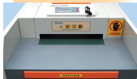
Large infeed deck with conveyor belt feeder and safety bar for immediate shut down