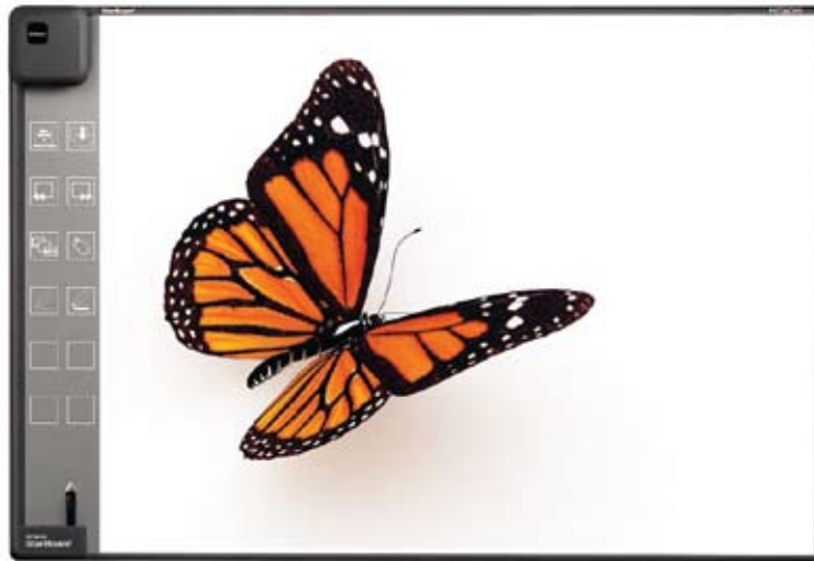
*FX-77GII pictured above