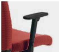
ADJUSTABLE T-ARMS Black