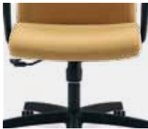
SWIVEL/TILT Occasional Use (3 hours or less)