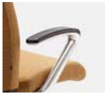
FIXED C-ARMS Polished Aluminum