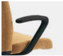
FIXED C-ARMS Black