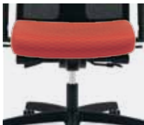
SYNCHRO-TILT WITH BACK ANGLE Extended Use (5-8 hours)