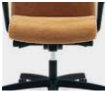
SYNCHRO-TILT Moderate Use (3-5 hours)