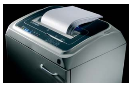
High shredding capacity Shreds up to 29 sheets of paper (A4 70 gr.) at a time. "AUTOMATIC REVERSE" System in case of jamming.