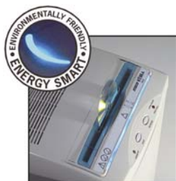
"ENERGY SMART" Management system for power saving stand-by mode