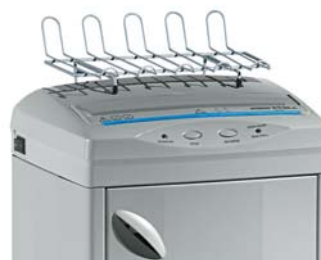
Computer forms top shelf to save office space (Space Saving Design)