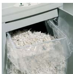
Front door for easy emptying of collecting bag