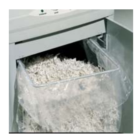
Front door for easy emptying of collecting bag