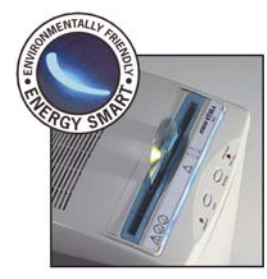
"ENERGY SMART" Management system for zero power consumption in Stand-by mode