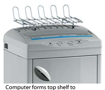
save office space (Space Saving Design)